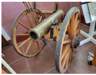
Replica Mountain Howitzer